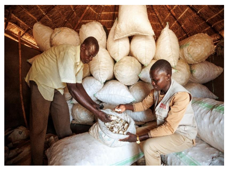
Uganda: Local farmers are supported to improve the management of value chains for better income..

Even though COVID-19 has brought additional challenges to the project, forcing the project, e.g., to suspend group activities for a long period, so far, the intervention proved to be effective.