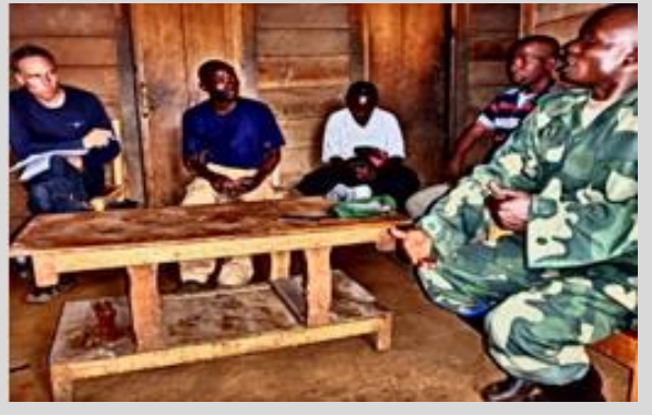
Working in hard-to-reach areas requires discussions with all relevant actors, including conflict parties, to allow for the implementation of interventions while ensuring safety

HEKS/EPER closely assesses conflict and crisis-affected areas and its options to reach those people who are cut off from other support and services. HEKS/EPER deploys highly experienced staff, security policies are constantly improved, and a security focal point is active in the different security networks.