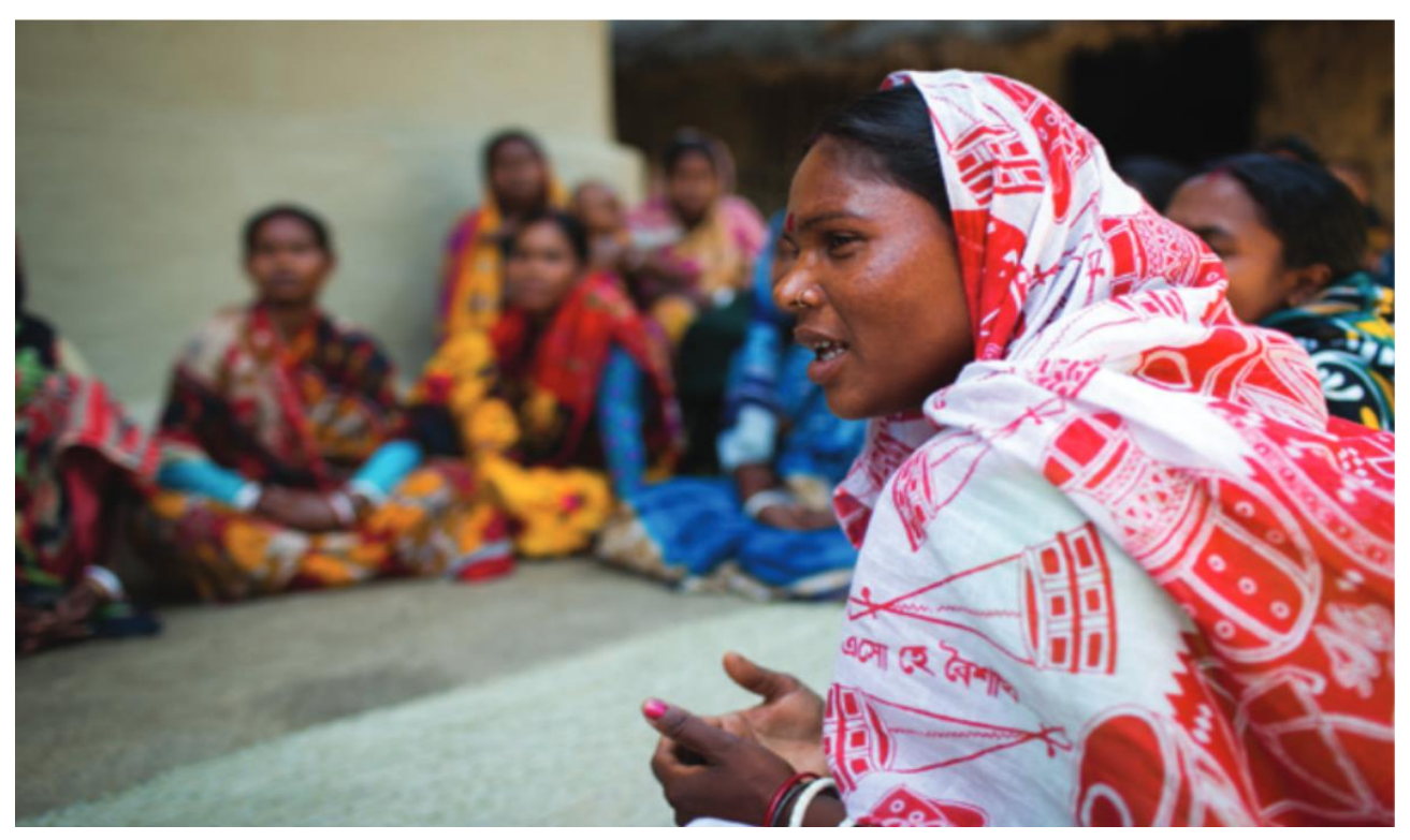
Bangladesh: Working with communities, relevant networks and competent partners helps to implement projects without doing harm.

HEKS/EPER strives to understand the context and its interaction with implementing organisations and the programmes or projects. It aims to act upon that understanding to avoid unintentionally feeding into further division, and to maximise the potential contribution to strengthening social cohesion and peace.