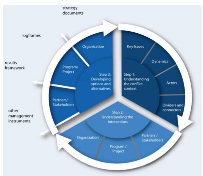
3-steps-model of conflict sensitivity developed by KOFF/Swisspeace.

Through its interventions and international presence,HEKS/EPER is part of the local contexts and has intended and unintended effects on these.In doing so, the organisation must prevent and/or mit igate negative effects . Beyond that, a systematically appliedconflict-sensitive approach leads to