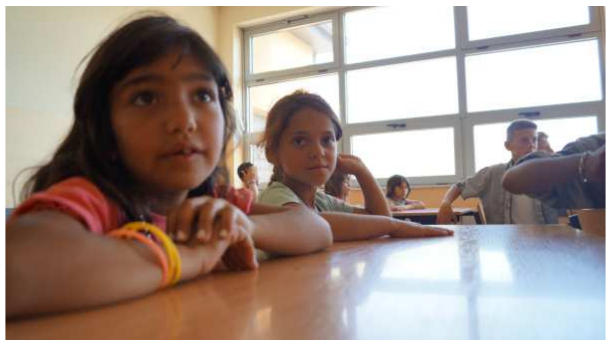
Afterschooling class in Kosovo.