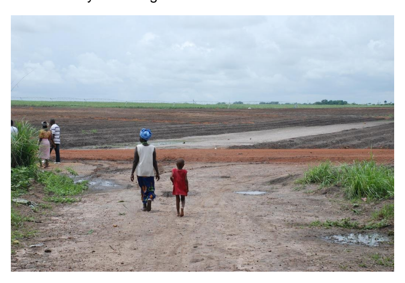
Figure 8: A woman and a child in front of the completely altered land

Also in Maronko, in Marmaria, in Waka and in all other villages people shared these sorrows. A woman in Yainkissa said that "we want Addax to continue because we got used to the money our husbands and kids earned. We could buy food. Now it is difficult." Therefore, even though they still have access to some amount of food, the purchasing power is limited to an extent that food security is lacking for now.