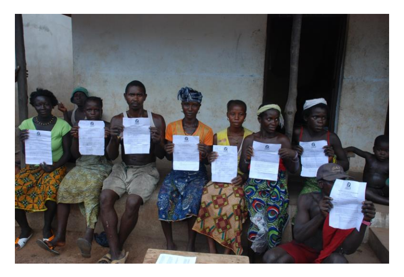
Figure 10: People holding their acknowledgement agreement in their hands

conclude, the Chief of Kolisoko even made it more explicit saying that they are now afraid of the government and the Paramount Chiefs. "They have signed the agreement, they are accomplices", he said.