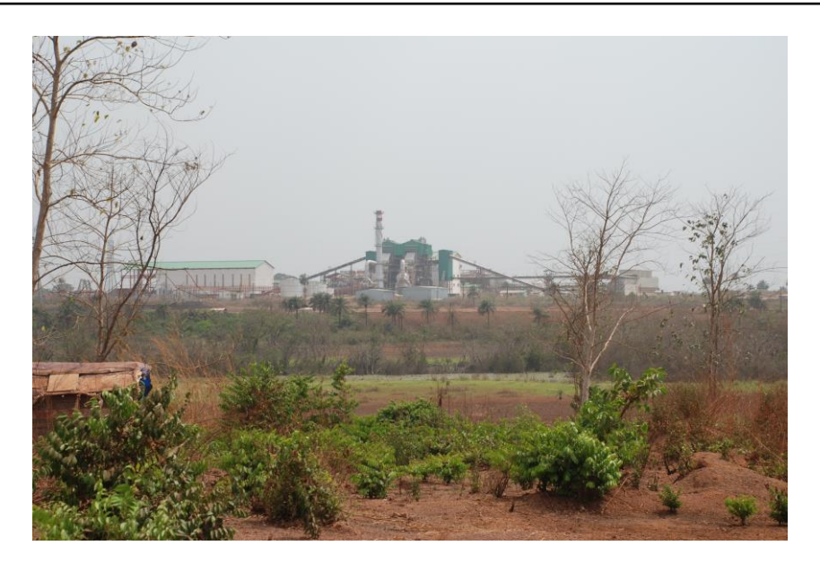
Figure 4: Factory that is shut down now