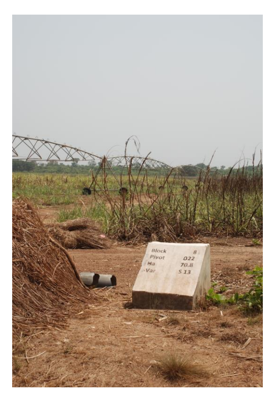
Figure 6: Pivot indicating the size of the land

profound consequences for the people living in the project area. For more information, we recommend a study about conflicts of customary land tenure that goes into detail about the Makeni project and shows how such a large-scale land acquisitions can exacerbate existing inequalities.<sup>43</sup>