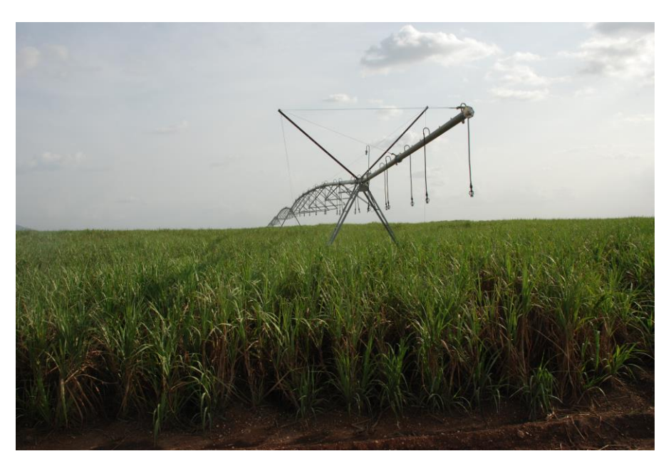
Figure 2: Pivot with sugarcane before the scale down

For the three years of the FDP, the company is supposed to plough and harrow the FDP fields for free and to provide seed rice for the farmers for three years. In the first and second year of the FDP, households are required to give back to Addax percentages of the rice harvested. Addax stores this rice for re-distribution as seeds for next year FDP or to give to other households entering the FDP. In the final year of the FDP households are not required to give any rice, but this also signifies the end of the FDP for them. From the fourth year onwards, villages leaving the FDP may subscribe to the Farmer Development Service (FDS) if they wish, if they apply and if they pay for the services. Under the FDS, Addax provides the following services at cost price to registered farmers: contract ploughing and harrowing; threshing; provision of seed and seed storage; transportation and a service desk to help farmers with their needs.