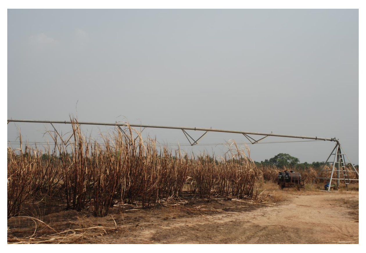
Burned down pivot in Addax project area

On the operations and the scale down of Addax Bioenergy in Makeni, Sierra Leone (period July 2014 – June 2016)