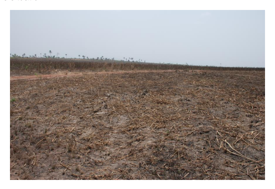
Figure 5: Sugarcane field that is completely burned down

Additionally, in the whole Addax area, huge parts of the pivots had been destroyed by bushfires at an extent unseen when Addax was in full operation or before. Addax officials and villagers blamed each other for these fires – both without clear evidence. Addax claims that it would be the villagers that burnt the sugarcane in revenge and that this made operations difficult for the company. Villagers argued that Addax workers would burn the sugarcane so that a new variety of sugarcane could be planted or the new seasonal crop would prosper on the burnt land. Also, the reasons do not need to be the same for all the fires and many people just said that they would not know what caused them. For the people however, these accusations have consequences. One woman of Romaro whose house burnt down as a consequence of the burning cane field claimed that she had asked Addax to help her out in this situation.