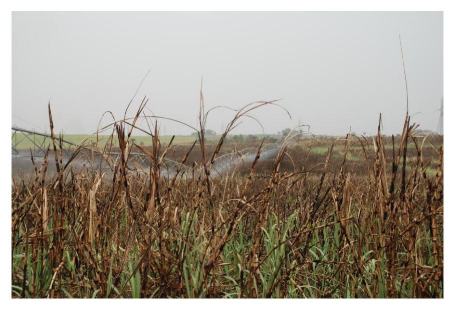
Figure 12: Irrigation of a burned down pivot with new sugarcane

When SiLNoRF posed the question to them about their expectations in case of shut down, there were lots of reactions. Most immediately they resorted to accept farming. This has been their occupation as far as they could remember. But also for that, support would be needed to restore the land.