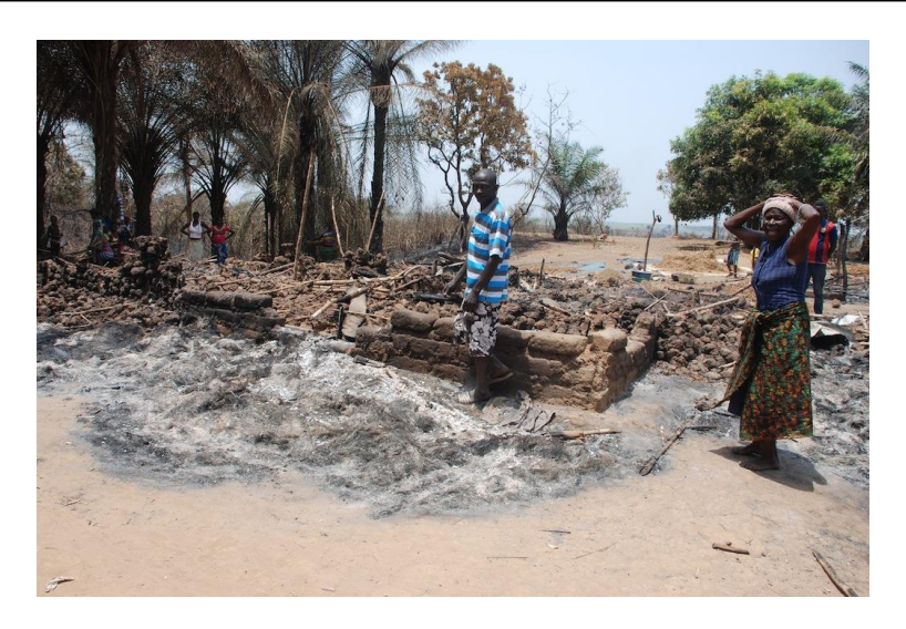
Figure 9: A house burned down completely in Waka